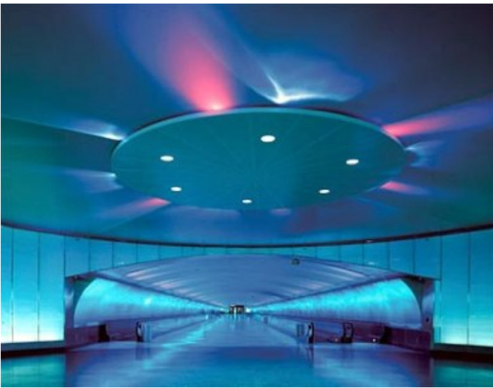
A picture of the new terminal and tram: